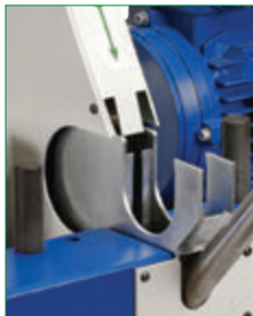
◀ CUTTING AREA