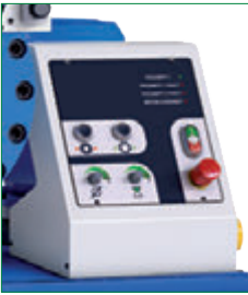
◀ ELECTRO-MECHANICAL CONTROL WITH ELECTRONIC DEVICE